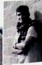
Saurabh Malpani Artha Studio, Pune

The Sonsbeek Sculpture Pavillion, Arnhem, The Netherlands , (built in 1966) by architect Aldo Van Eyck remains a timeless source of inspiration. For five decades, Pavillion has been an imperative part of architectural history. It comprises a set of parallel walls; some curving to form semicircular spaces, some transforming simple linear spaces into complex spatial device. It depicts a large house and a concurrently small city. In the world of exposition it exhibits the human element. It is a masterpiece of Van Eyck's poetic vision that is supplemented by his indispensable architectural thinking.