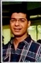
Shezaan Bhojani Design Café, Bangalore

The Sonsbeek Sculpture Pavillion, Arnhem, The Netherlands , (built in 1966) by architect Aldo Van Eyck remains a timeless source of inspiration. For five decades, Pavillion has been an imperative part of architectural history. It comprises a set of parallel walls; some curving to form semicircular spaces, some transforming simple linear spaces into complex spatial device. It depicts a large house and a concurrently small city. In the world of exposition it exhibits the human element. It is a masterpiece of Van Eyck's poetic vision that is supplemented by his indispensable architectural thinking.